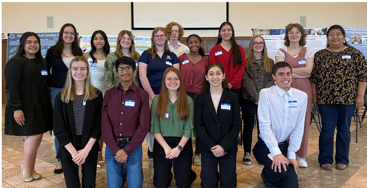
Participating Scholars Above: