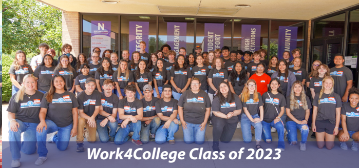
Work4College Class of 2023

WORK 4 COLLEGE Northeast Texas Community College